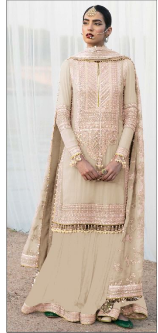
S - 98 D