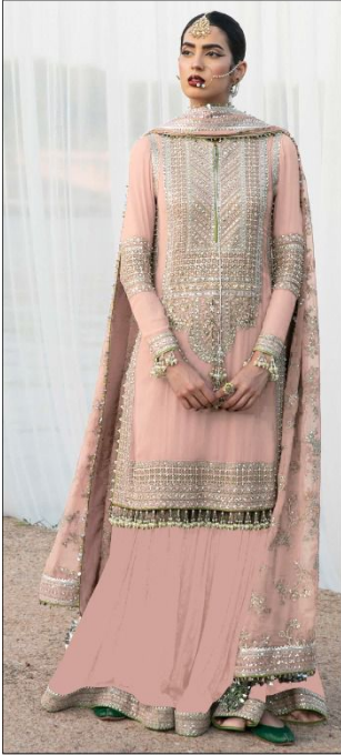
S - 98 A

TOP - FOX GEORGETTE EMBROIDERD WITH HAND WORK BOTTOM- HEAVY SANTOON WITH LACE WORK INNER - HEAVY SANTOON DUPATTA - NAZNEEN HEAVY EMBROIDERED WITH FOUR SIDE LACE WORK