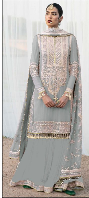
S - 98 C