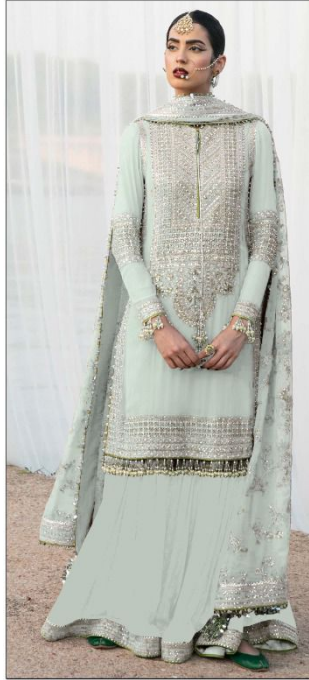
S - 98 B