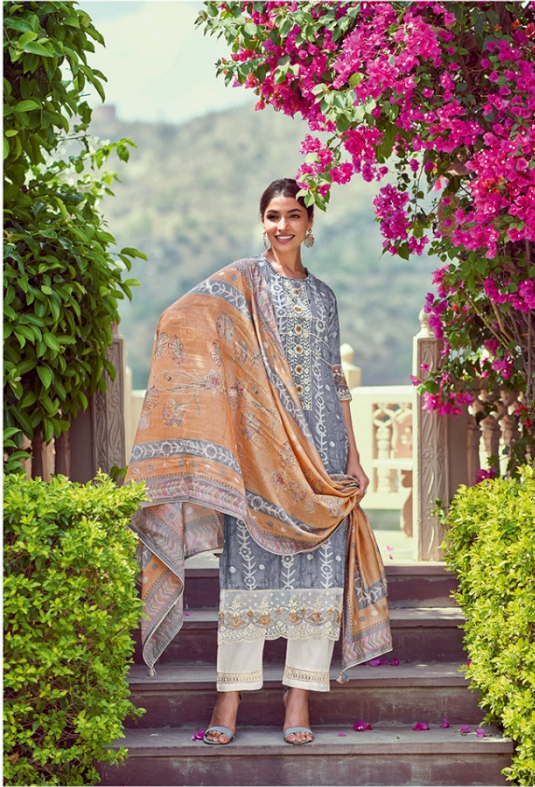
BAGEECHA | 8096