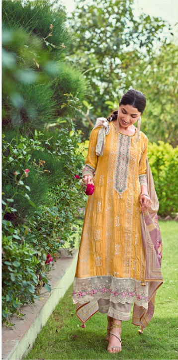
The collection was a perfect blend of Indian silhouettes & contemporary style