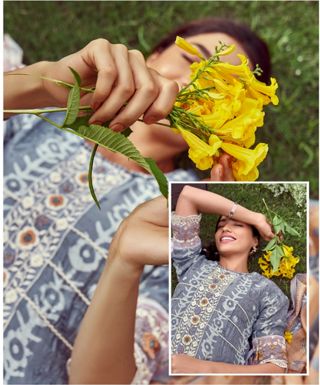
The glamour is something which will fulfill all the requirement for glossy & trendy look